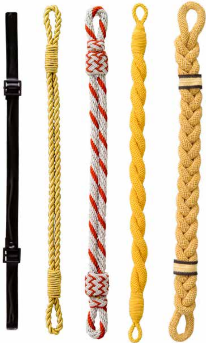
CAP CORDS & CHIN STRAPS