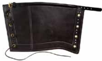
GLOVES & ANKLETS