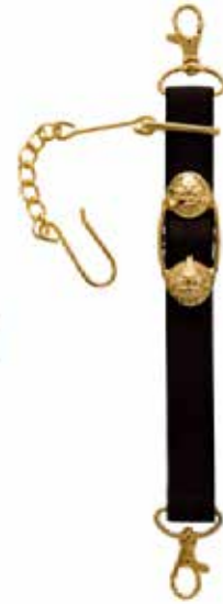
SWORD SLINGS & SWORD BELTS