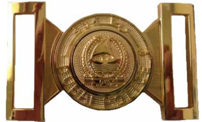
BELTS & BUCKLES