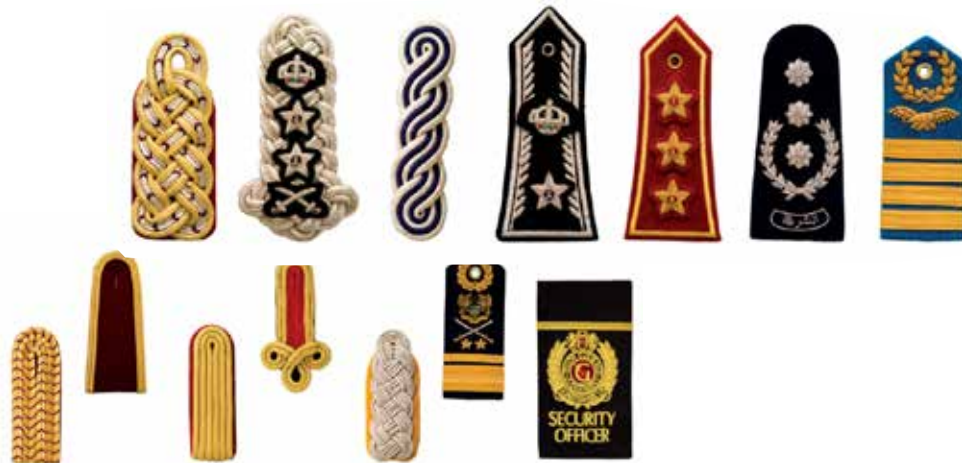
SHOULDERS & EPAULETTES